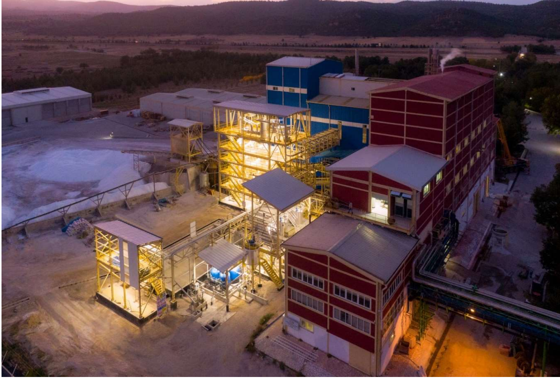
Alkim Potasyum Sulfat Facility