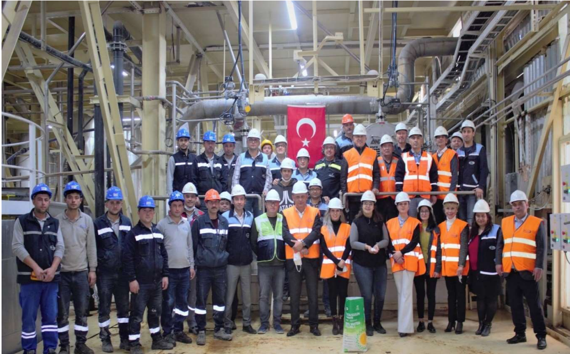
Potassium Sulphate production - pride

Contact Alkim Kimya – Çağla Koçel +90 212 292 22 66 cagla.kocel@alkim.com www.alkim.com