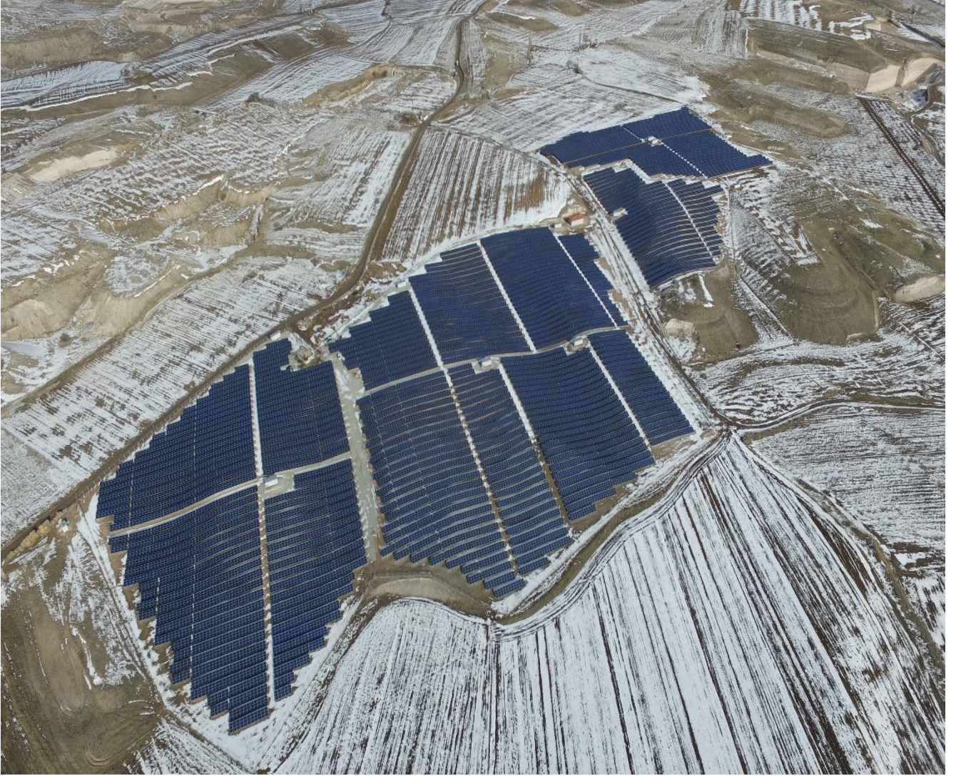
* Nevşehir Plant View