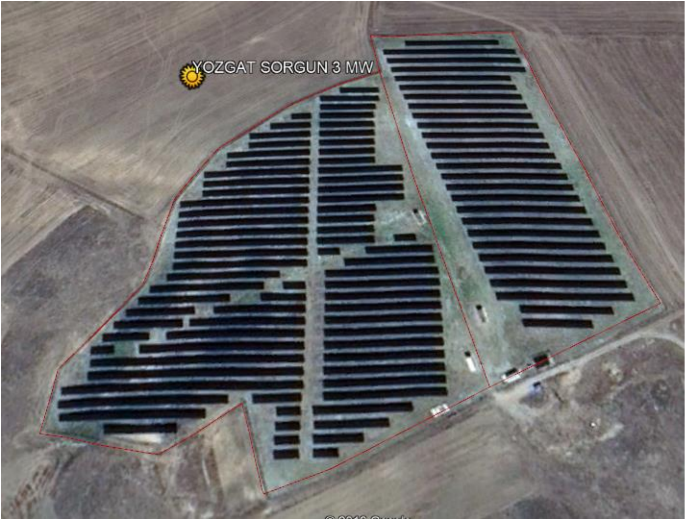
* Yozgat Plant View