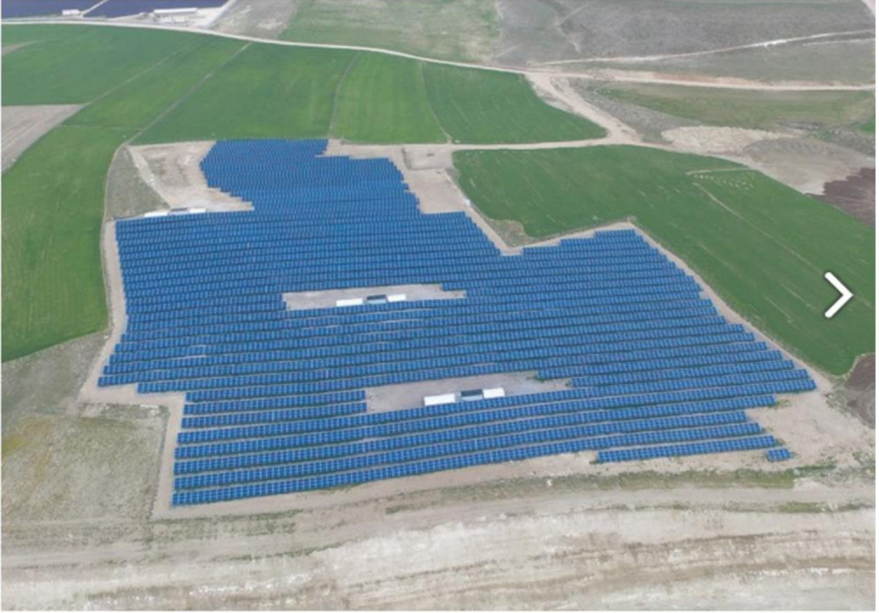
*Afyon Sinanpaşa Plant View