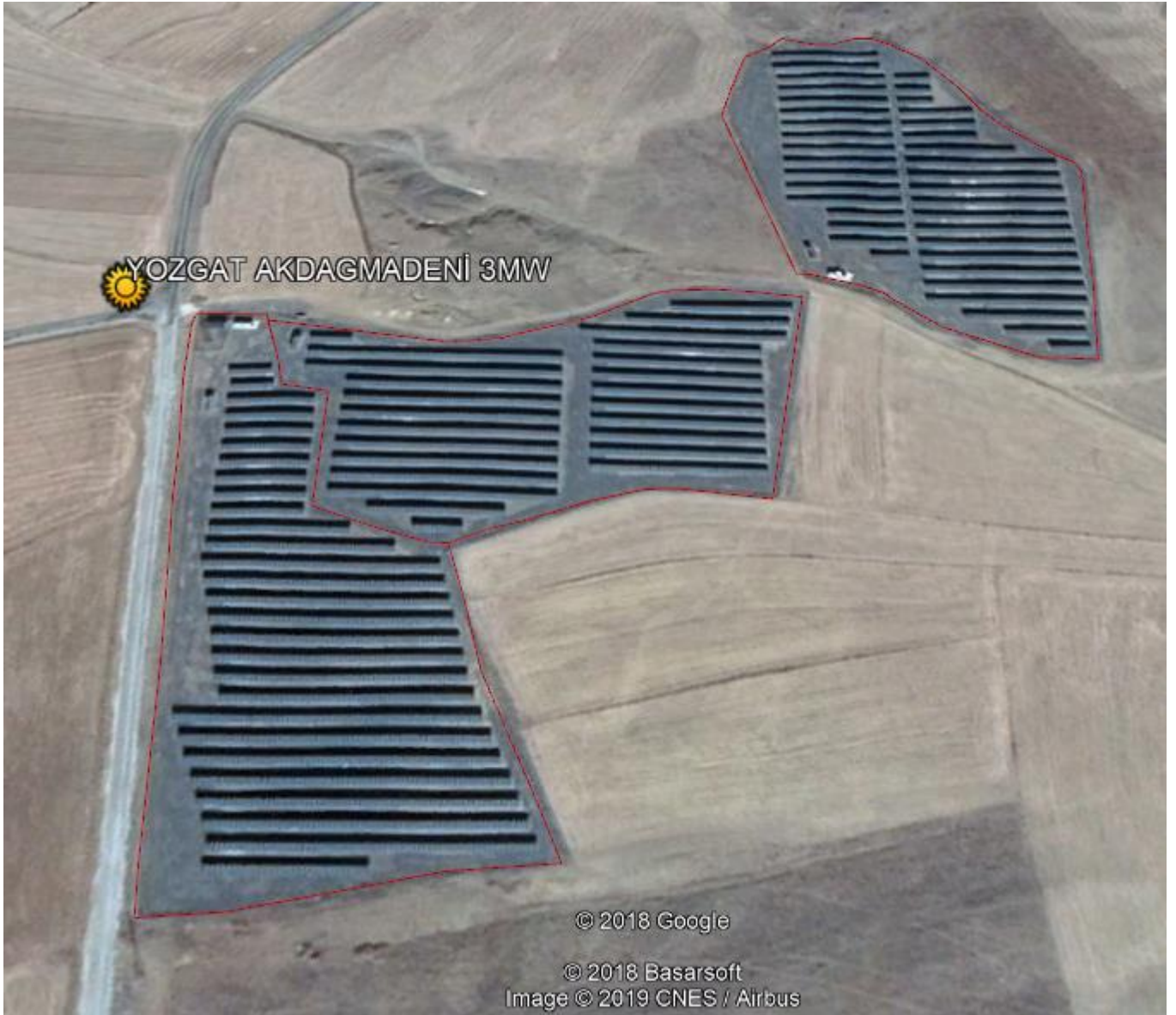
* Yozgat Plant View