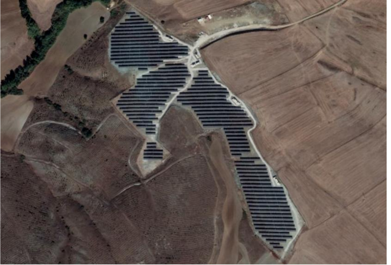
*Bilecik Plant View